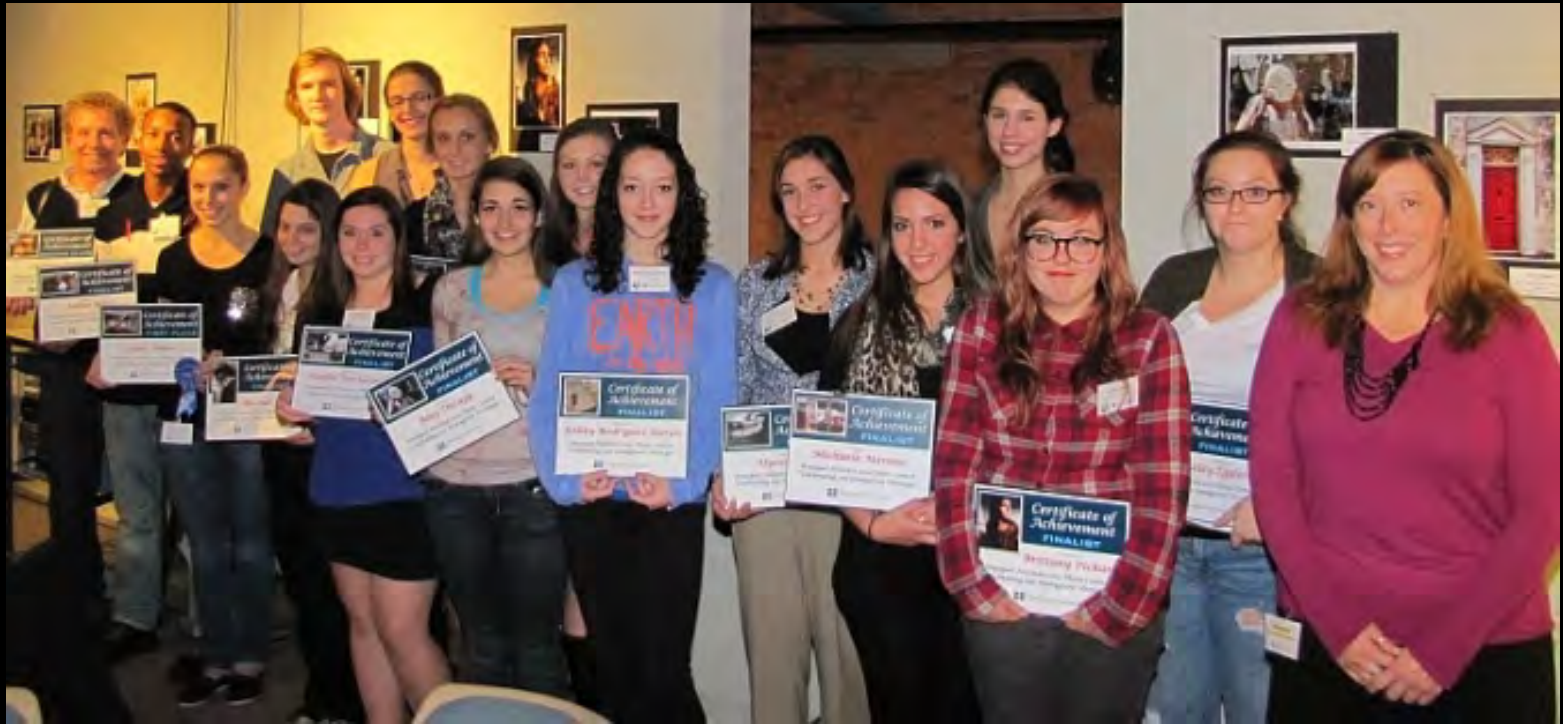
2012 Bousquet Holstein Photo Contest Finalists and Teachers